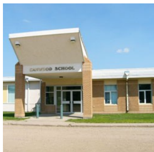
CANWOOD PUBLIC SCHOOL NEWSLETTER

850-1st Street East Box 370 Canwood, SK S0J 0K0